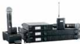
ULX-D® DIGITAL WIRELESS Digital Wireless Microphone Systems