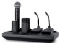
MICROFLEX® WIRELESS Wireless Microphone Systems