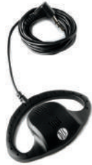
DH6225 Earclip Headphone