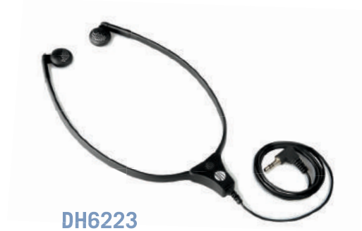
DH6223 Stethoscopic Headphone