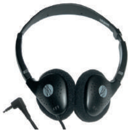
DH6021 Stereo Headphone