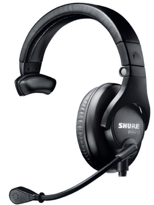
BRH441M Single-Sided Broadcast Headset