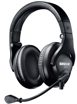
BRH440M Dual Sided Broadcast Headset