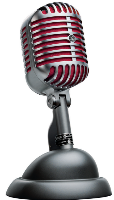
5575LE Unidyne® Limited Edition 75 th Anniversary Model